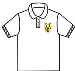
White Polo Shirt