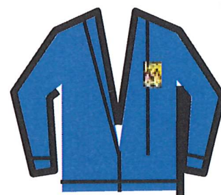
Royal Blue Cardigan