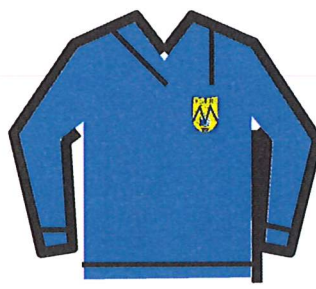
Royal Blue V Neck Jumper