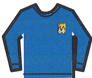
Royal Blue Sweatshirt