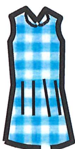
Blue and White Gingham Summer Dress