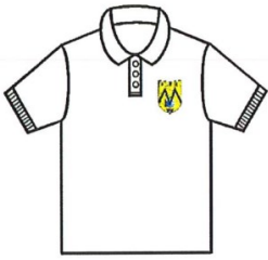
White Polo Shirt