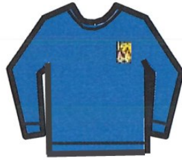
Royal Blue Sweatshirt