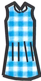
Blue and White Gingham